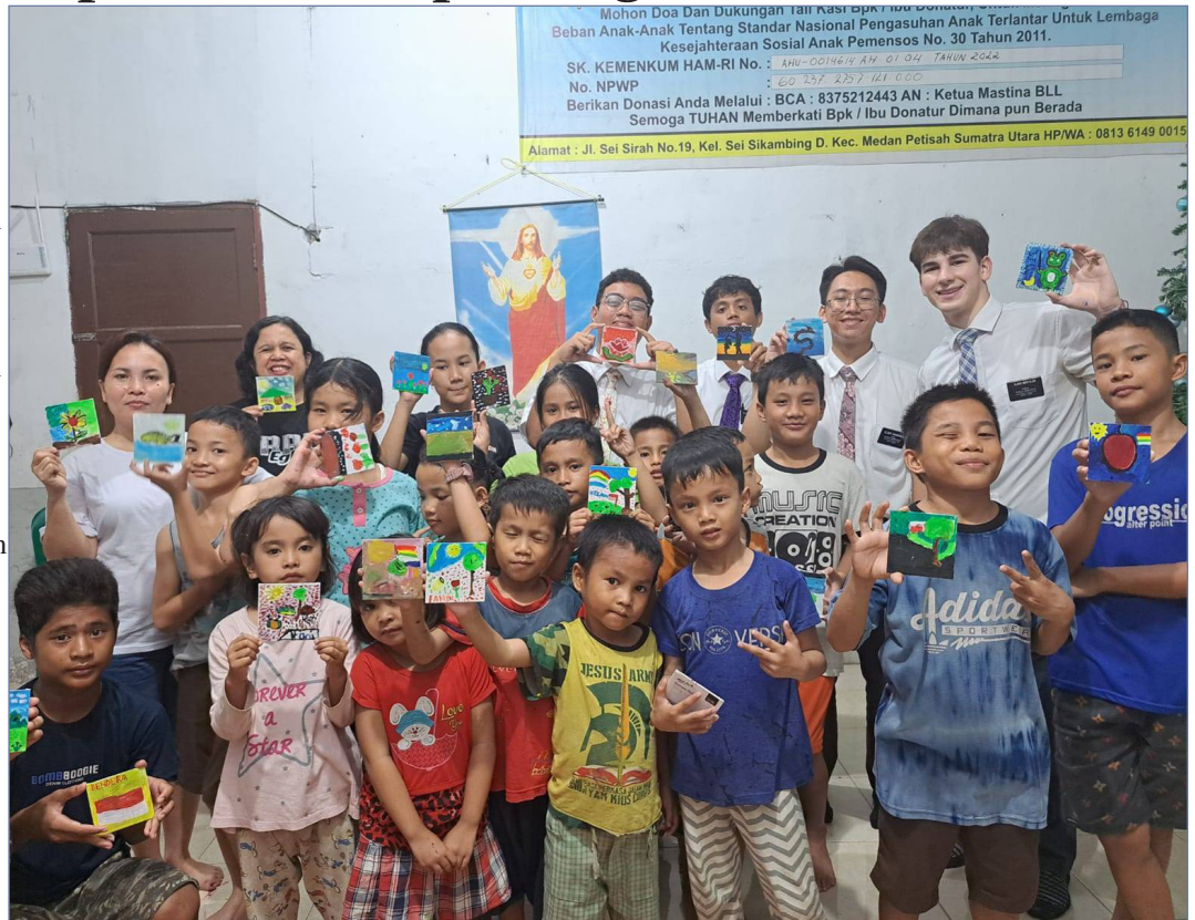
The Jaredita Foundation has started accepting donations for the Bina Kasih Orphanage.

Thanks to all of you who have already contributed to support this new expanded vision of the Jaredita Foundation as it continues to help children in Indonesia prepare for a brighter future.